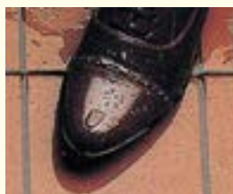
Plain tiles are suitable for normal applications which may be occasionally wet.

Chemical Resistance All Ruabon quarry tiles are highly resistant to most household cleaners, swimming pool chemicals and a range of acids and alkalis.