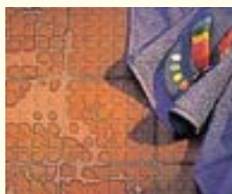
Studded tiles are ideal for all 'barefoot' applications.

Stain Resistance Most stains are easily removed using warm water and detergent.