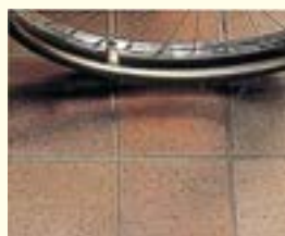
Quarrundum® anti-slip tiles ensure safe, durable surfaces even in frequently wet conditions.