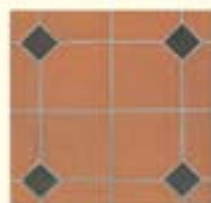
Brecon 194x194mm with 72x72mm Hafod Black insets