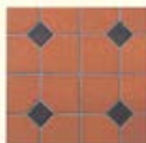
Conway 150x150mm with Hafod Black insets 72x72mm